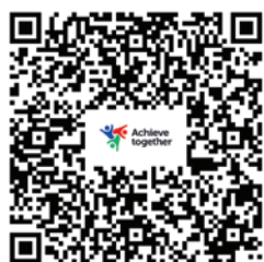
Professional newsletter sign-up

Click the link or scan the QR code to get our monthly update packed full of news and features that give you an insight into life here at Achieve together.